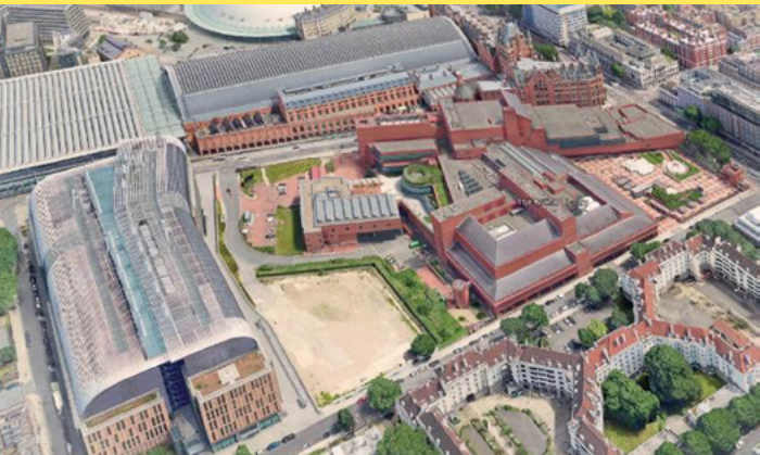
Aerial view of the site before the Story Garden was created (left) and an image to show what the proposed British Library extension could look like on completion (right)