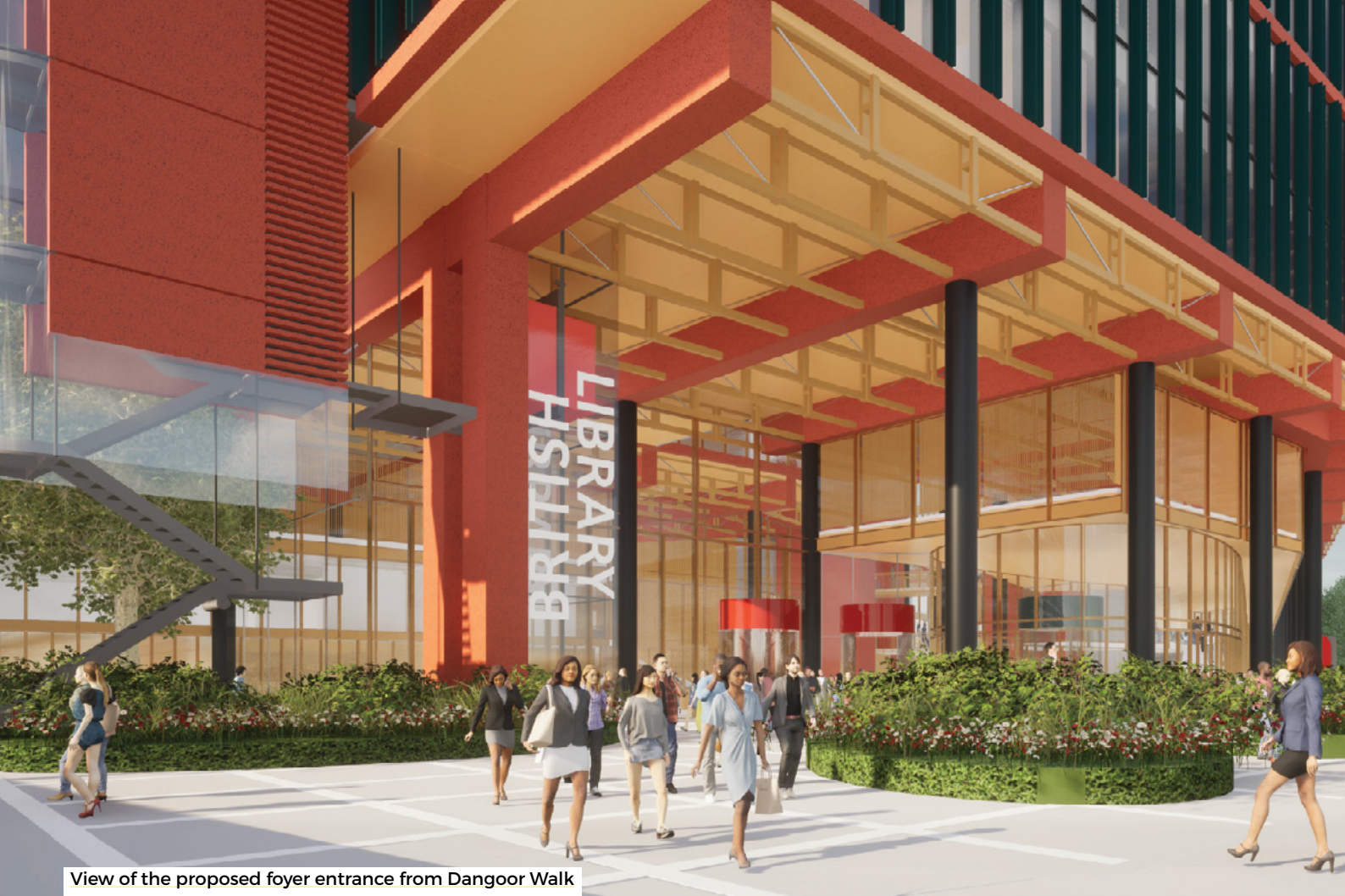
View of the proposed foyer entrance from Dangoor Walk

We will continue to develop the designs and would still like to hear your thoughts on the project. You can find out more and let us know by contacting us through one of the following ways: