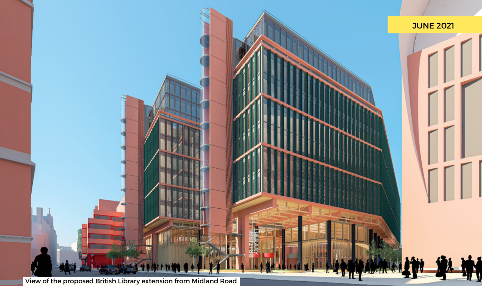
View of the proposed British Library extension from Midland Road